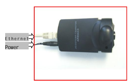
Figure 5. Installation diagram